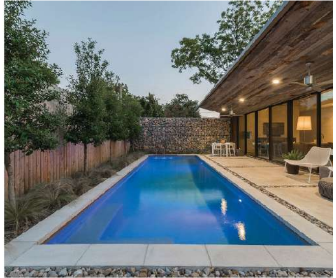
Linder: The minimalistic design of the pool + landscaping compliments the basic shape of the architecture. By maintaining simplicity in the landscape design, through grasses and concrete, the dominate form of the residence shines.

AquaTerra Outdoors is an international award-winning full-service design + build firm passionate about outdoor living. Since 2007, AquaTerra has been building and designing luxury outdoor environments filled with pools, landscaping, outdoor structures, and more. Each project is approached with an open mind, allowing them to craft environments that are as unique as their clients. AquaTerra's design solutions emphasize a seamless relationship between indoor spaces and outdoor living. Everyone on the design + construction teams share a passion for exquisite landscapes and outdoor lifestyles. AquaTerra stands apart from other pool builders and landscape architects due to their ability to handle the moving parts of design and construction in house. Since its inception, AquaTerra has maintained a singular focus on offering uncompromising outdoor environments to discerning clients. Each and every AquaTerra environment is the result of our collaboration with passionate clients whose desire for excellence extends from their homes into their outdoor play and living spaces. 4252 Marsh Ridge Rd. Carrollton, TX 75010, 214.387.8333, info@aquaterraoutdoors.com.