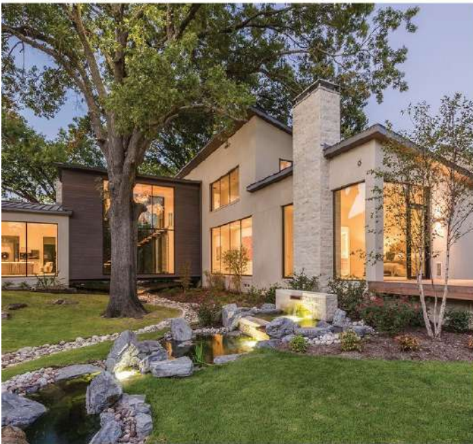
Darver: A spacious yard in the middle of the city initiated the opportunity to create an environment distant from city life. A creek bed that flows to a stream under the corridor of the home provides the space with the tranquility of a nature preserve.

» Each and every AquaTerra environment is the result of our collaboration with passionate clients whose desire for excellence extends from their homes into their outdoor play and living spaces. »